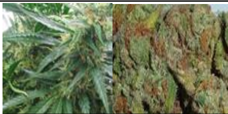
Cannabis, marijuana, hemp