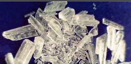
Stimulants Methamphetamine Amphetamine

*Use of cannabis in Japan, and the export of New Psychoactive Substance (NPS) from Japan are not prohibited by the current laws.